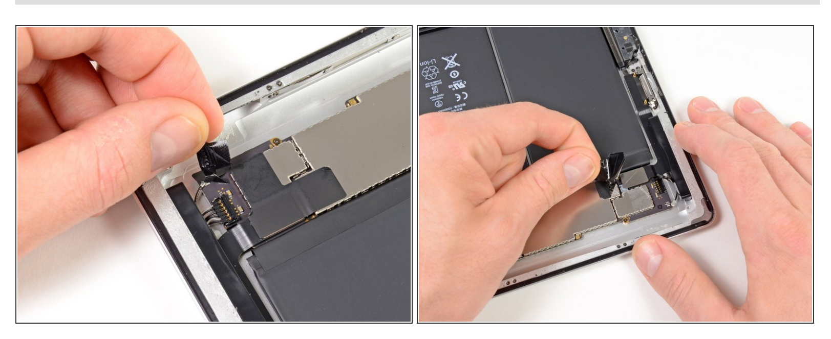
if present, remove the pieces of electrical tape covering the Wi-Fi antenna, speaker cable, and dock connector cable.

To reassemble your device, follow these instructions in reverse order.